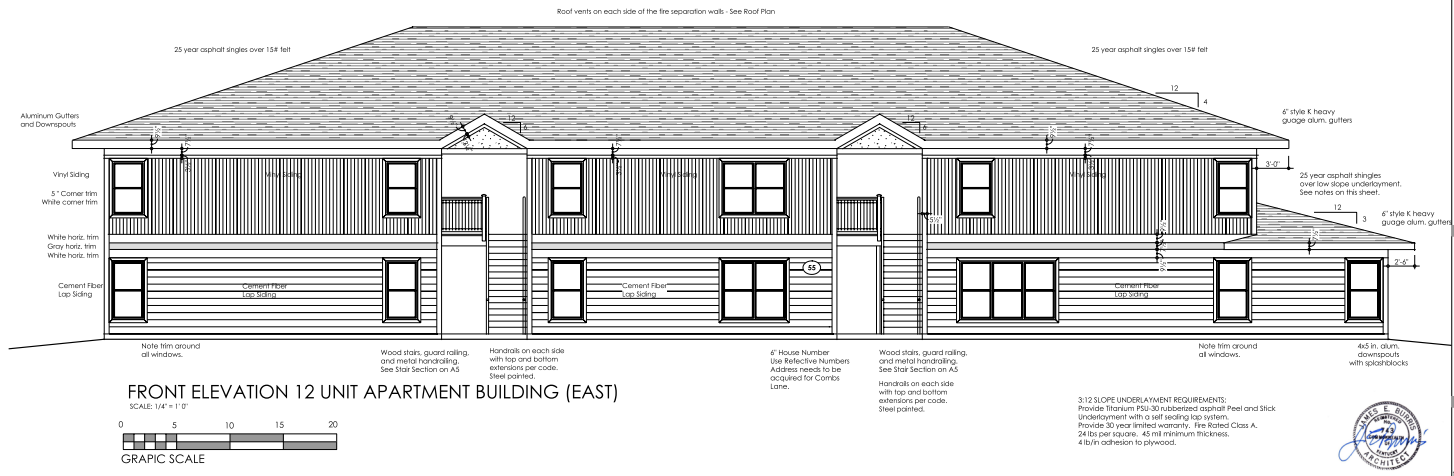
FRONT ELEVATION 12 UNIT APARTMENT BUILDING (EAST) SCALE: 1/4" = 1' 0" GRAPHIC SCALE

against the city of Hazard with the help of the state's fair housing council. The evidence supporting KCADV's claim of housing discrimination was so strong, city officials called within days of receiving the complaint asking what it would take to settle. The answer was simple: KCADV asked the city to provide land suitable for housing development.